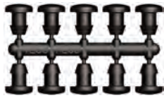
Repair Plugs (Rack of 10)