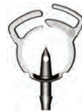
Micro Saddle OD16 - 18 with 4.5 mm Barbed Take-Off Adaptor