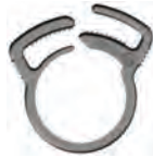
Ratchet Clamp OD16 - 18