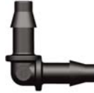
Elbow, 4.5 mm Barb