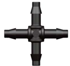
Cross, 4.5 mm Barb