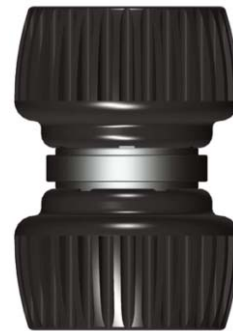
Adaptor, 3/4" Female Thread x 3/4" Female Thread