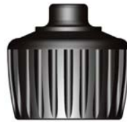
Self Tapping Micro Adaptor x 1/2" Female Thread