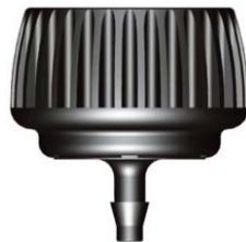
3/4" BSP Female Nut x 4.5 mm Barb