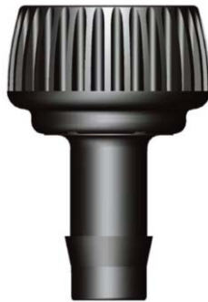
3/4" BSP Female Nut x 13 mm Barb 14 mm Barb 16 mm Barb 20 mm Barb