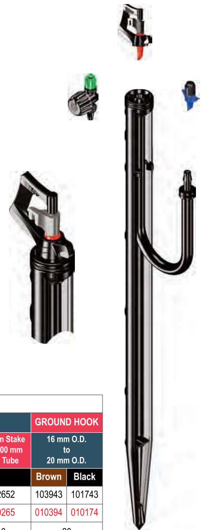
Ultra™ Stake with Micro Adaptor for direct connection of 10-32 UNF & "Fast" Threaded Bases