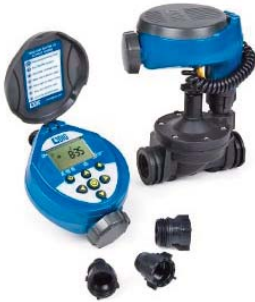
400A Series Battery Operated Controllers