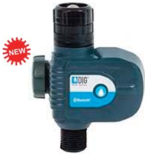
BOHE-BT I Bluetooth® Hose End Timer