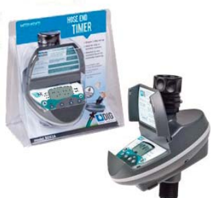
B09D Digital Hose End Timer