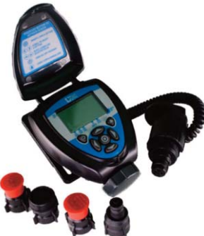
710AP-000 Series Propagation Controller