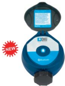
410BT Series Bluetooth® Battery Operated Controller