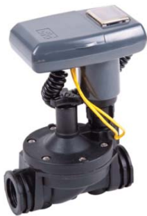
LEIT 1™ In-Line Valve